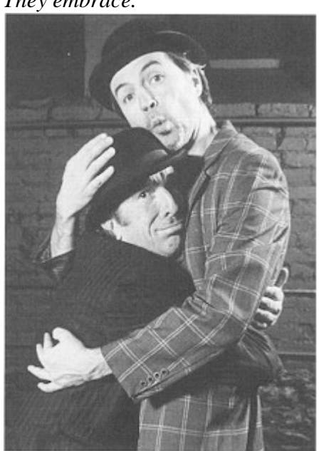
Estragon recoils.) You stink of garlic!

(step forward). You're angry? (Silence. Step forward). Forgive me. (Silence. Step forward. Estragon lays his hand on Vladimir's shoulder.) Come, Didi. (Silence.) Give me your hand. (Vladimir half turns.) Embrace me! (Vladimir stiffens.) Don't be stubborn! (Vladimir softens. They embrace.