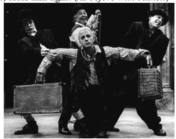
Now! You can let him go. (Vladimir and Estragon move away from Lucky who totters, reels, sags, but succeeds in remaining on his feet, bag

Don't let him go! (Vladimir and Estragon totter.) Don't move! (Pozzo fetches bag and basket and brings them towards Lucky.) Hold him tight! (He puts the bag in Lucky's hand. Lucky drops it immediately.) Don't let him go! (He puts back the bag in Lucky's hand. Gradually, at the feel of the bag, Lucky recovers his senses and his fingers finally close round the handle.) Hold him tight! (As before with basket.)